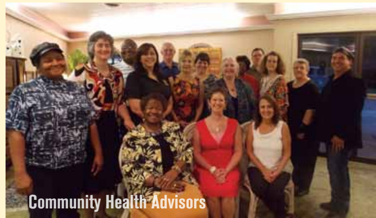
Community Health Advisors