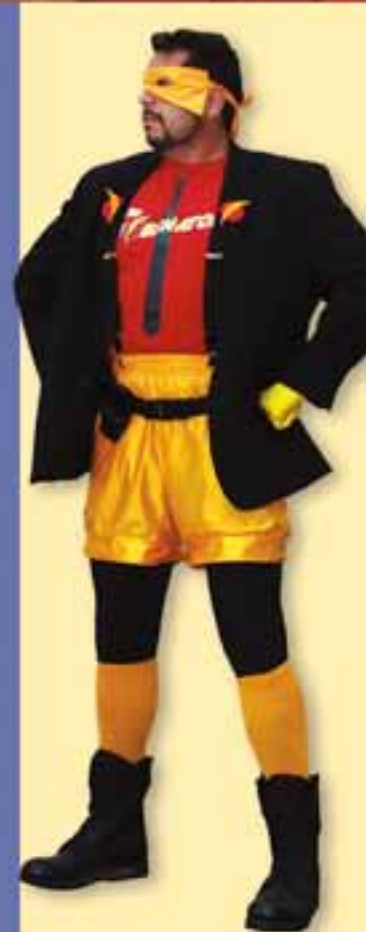
The Jobinator was created to get high school students involved in the Cenla Work Ready Network.

The Foundation believes there has to be a broader, overarching effort at improving business culture and environment, and provides a grant to CLEDA to support that objective. A focus of CLEDA is to support business retention and expansion, and those efforts have resulted in major new business investments in Central Louisiana.